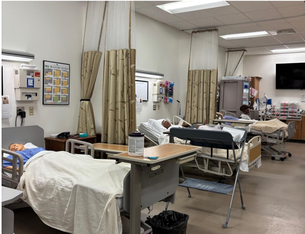
A hands-on practice skills lab in Building 7 for nursing students. Multipurpose mannequins and a medication dispensing machine allow students to practice a variety of skills in a safe environment.

Spokane's healthcare sector is listed by Spokane Workforce as the county's top industry, with over 47,000 employees as of 2023, beating the second-largest industry (Government, including Public Education) by about 11,500 workers. Within this apex, growing industry, the Licensed Practical Nurse (LPN) is in high demand, with internal resources estimating a 5% growth in demand over the next decade. Demand for LPNs was already looking rosy prior to 2020, but the pandemic accelerated our country's need for qualified healthcare professionals exponentially. Wage growth has gone up alongside this demand and LPNs in Spokane can expect a median salary that is nearly 15% higher than the median LPN salary nationally.