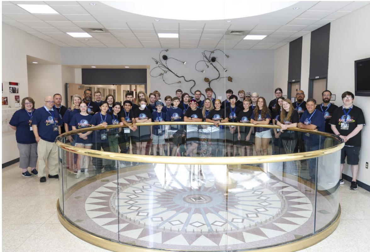
Participating students and faculty at the GenCyber 2024 Summer Camp gathered around the Foucault Pendulum in Building 18.

SFCC was selected to host the GenCyber 2024 Summer Camp, sponsored by the NSA and hosted the previous year by Eastern Washington University. Open to 9-12th grade students in the Inland Northwest, GenCyber Summer Camp is an excellent opportunity to learn cybersecurity skills through gamification challenges from high school, college, and university faculty. SFCC collaborated with local high schools to recruit attendees as well as the Girl Scouts of America, YWCA, and local tribal organizations to attract students from underrepresented groups in the industry. Subjects covered this summer through hands-on activities included social engineering, OS hardening, wi-fi attack and defense, cryptography, and digital forensics.